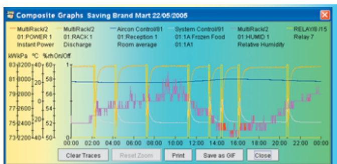
Composite graphs allow comparison of different parameters