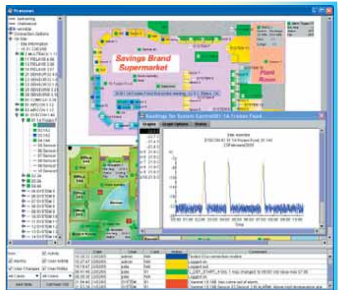
Pressnet layout is clean and simple to use

So for easy, total control of your refrigeration or AC plant, whether on site or remotely, Pressnet Software provides a total solution.